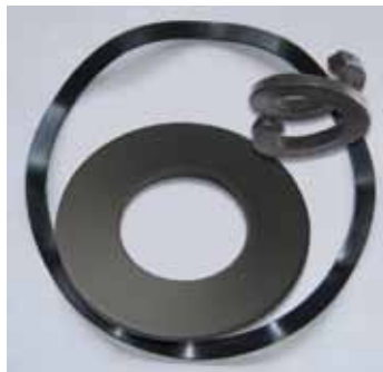
Wave Spring, Belleville Washer and Coil Spring

Drawbacks: Dissipating preload as spring fatigues, and allows yield during impact which may be detrimental to assembly (such as with a ring and pinion meshing gear set). Difficult to adjust.