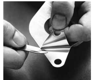
Surface Bonded Shims

Drawbacks: Sometimes it is difficult to peel layers, and discarded layers must be scrapped.