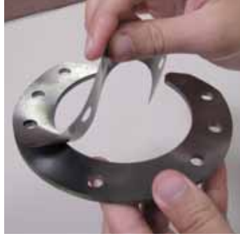
Edge Bonded Shims are easy to peel. Unused layers can be used for another application.

Benefits: Easy to peel layers. Simple and inexpensive design, maintains constant preload between service intervals, and allows for the easiest service in the field with less parts stocking. Unused layers may be used in a different assembly.